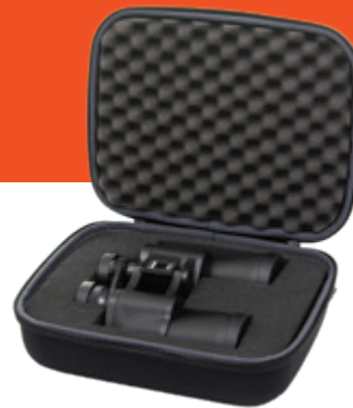
Customizable cubed foam