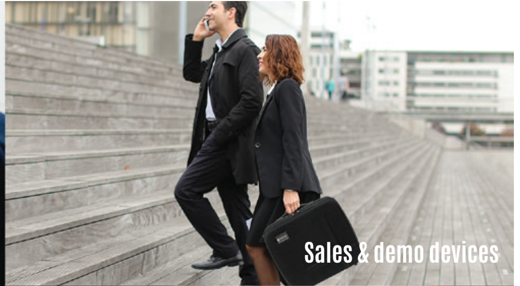
Sales & demo devices