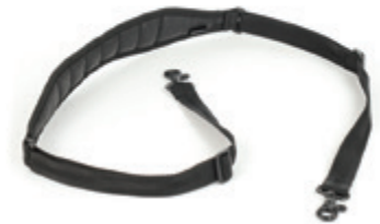
Shoulder Strap A