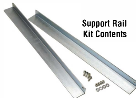
Support Rail Kit Contents